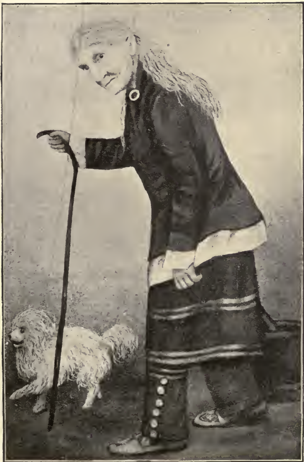
MARY JEMISON, THE CAPTIVE.