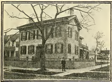
Lincoln's Home at Springfield, Illinois

The chairs are true replicas in every detail. They are constructed of Birch and Mahogany