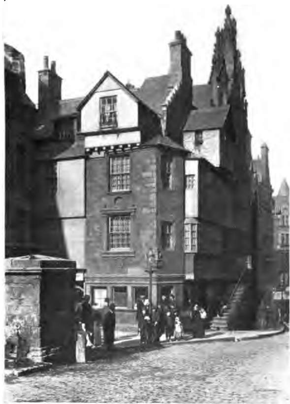
JOHN KNOX'S HOUSE, EDINBURGH