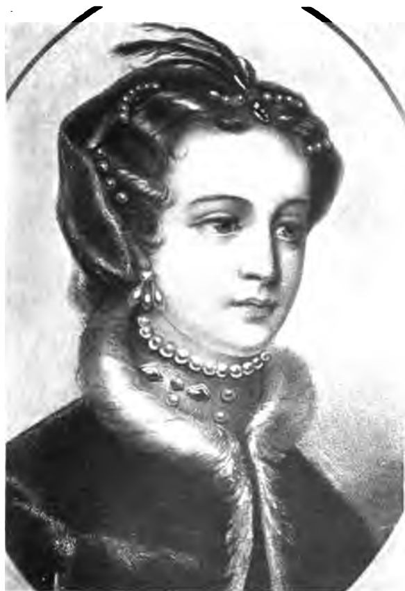
MARY QUEEN OF SCOTS