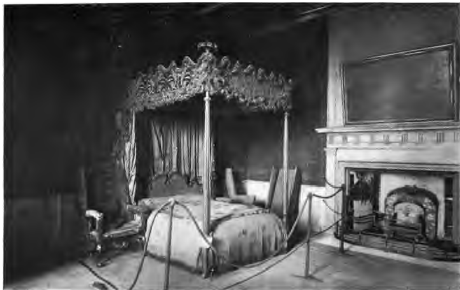
BED OF CHARLES I. IN QUEEN MARY'S AUDIENCE CHAMBER, HOLYROOD