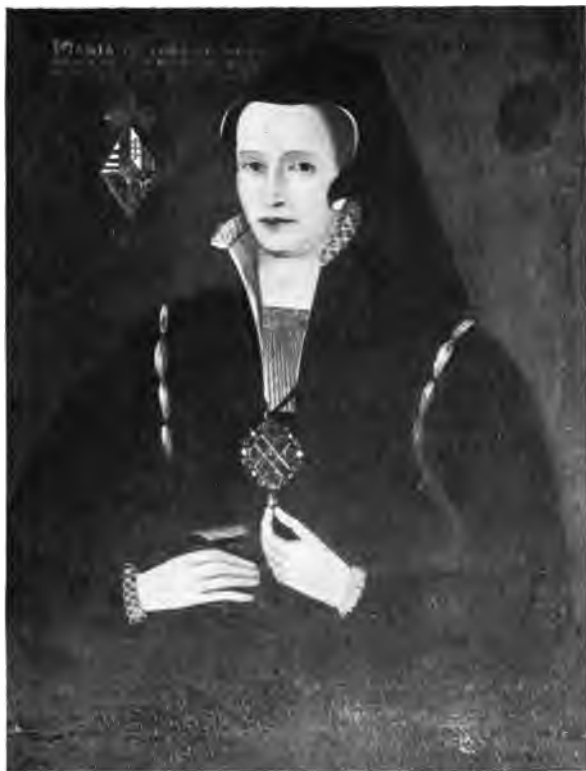
MARY OF LORRAINE