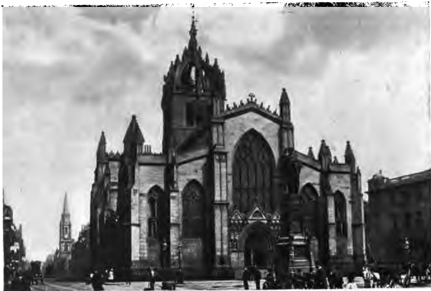
ST. GILES'S CHURCH, EDINBURGH