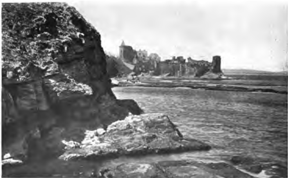
ST. ANDREWS CASTLE FROM SOUTH-EAST. "MAIDEN ROCK" IN THE FOREGROUND