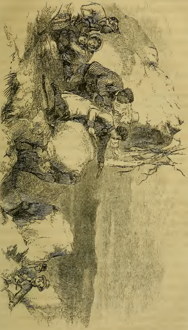
THE FREEMAN'S DEFENCE. Page 384.