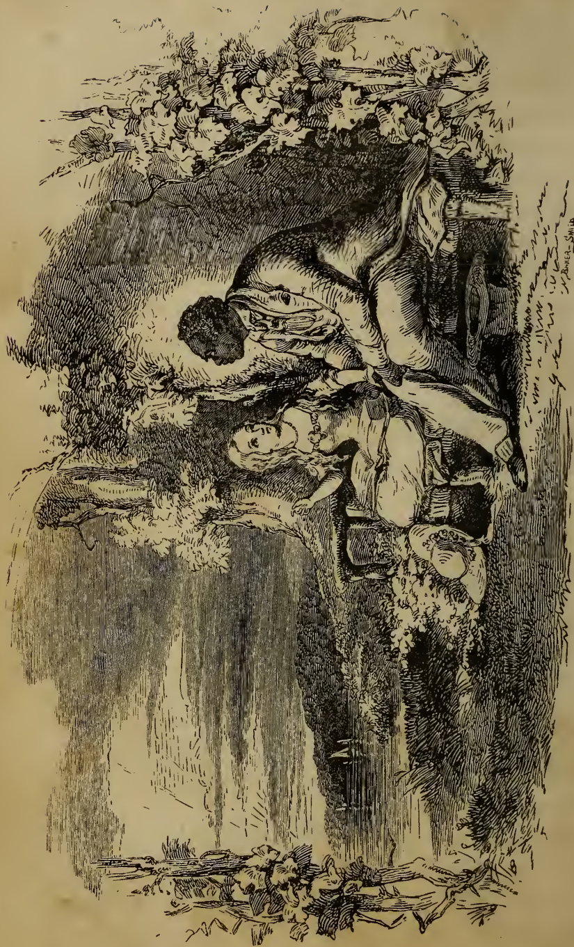
LITTLE EVA READING THE BIBLE TO UNCLE TOM IN THE ARBOR. Page 65.