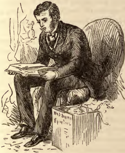
"He found the date of the birth of 'Lillie Ellis.'"

But John, who was curious in the matter of books, sat quietly down in a corner to examine it; and on the middle page, under the head "Family Record," he found, in a large, bold hand, the date of the birth of "Lillie Ellis" in figures of the most uncompromising