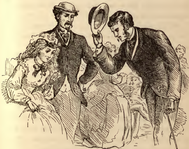
"Let me present my friend, Mr. Seymour."

Carryl came up with the lady on his arm; and as he stood there for a moment, in the coolest, most indifferent tone in the world, said, "Oh! by the by, Miss Ellis, let me present my friend Mr. Seymour."