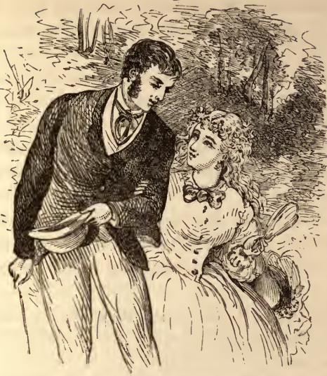
“Lillie was leaning confidentially on John’s arm.”

wonderful boldness, and at the grace of the fair entertainer.