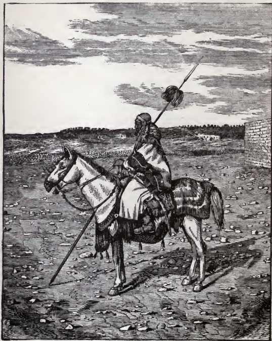
An Arab Sheikh.