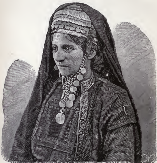
A Syrian Woman.