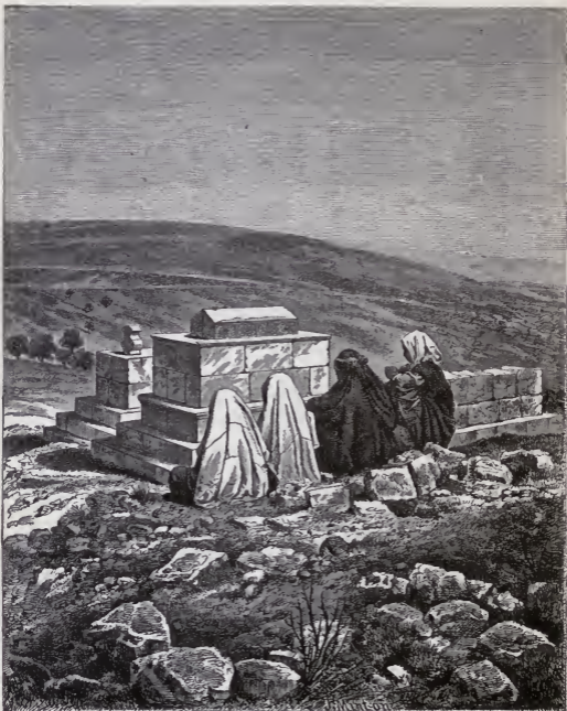
Women Weeping at the Tomb.