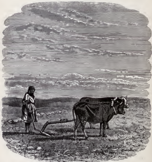
An Arab Ploughing.