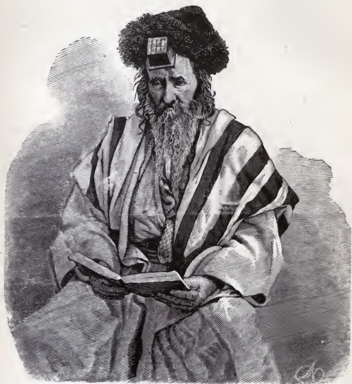
A Jew with the Phylactery.