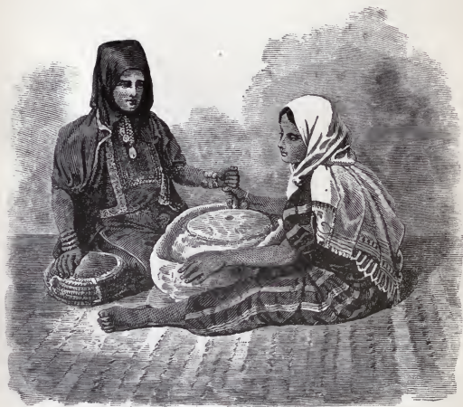
Women Grinding at a Mill.