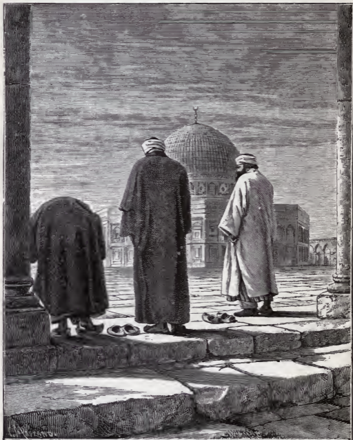
Moslems at Prayer.