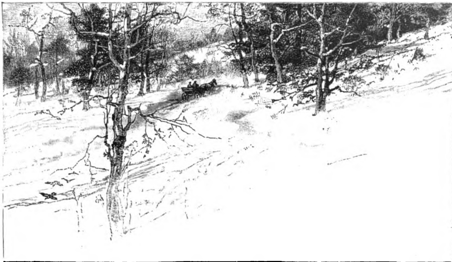
A MOUNTAIN ROAD