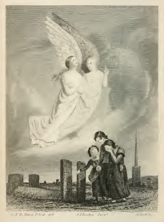
True it separates, but it unites also, It takes us I know from many we love but it takes us to as many we love." Lapit 221.