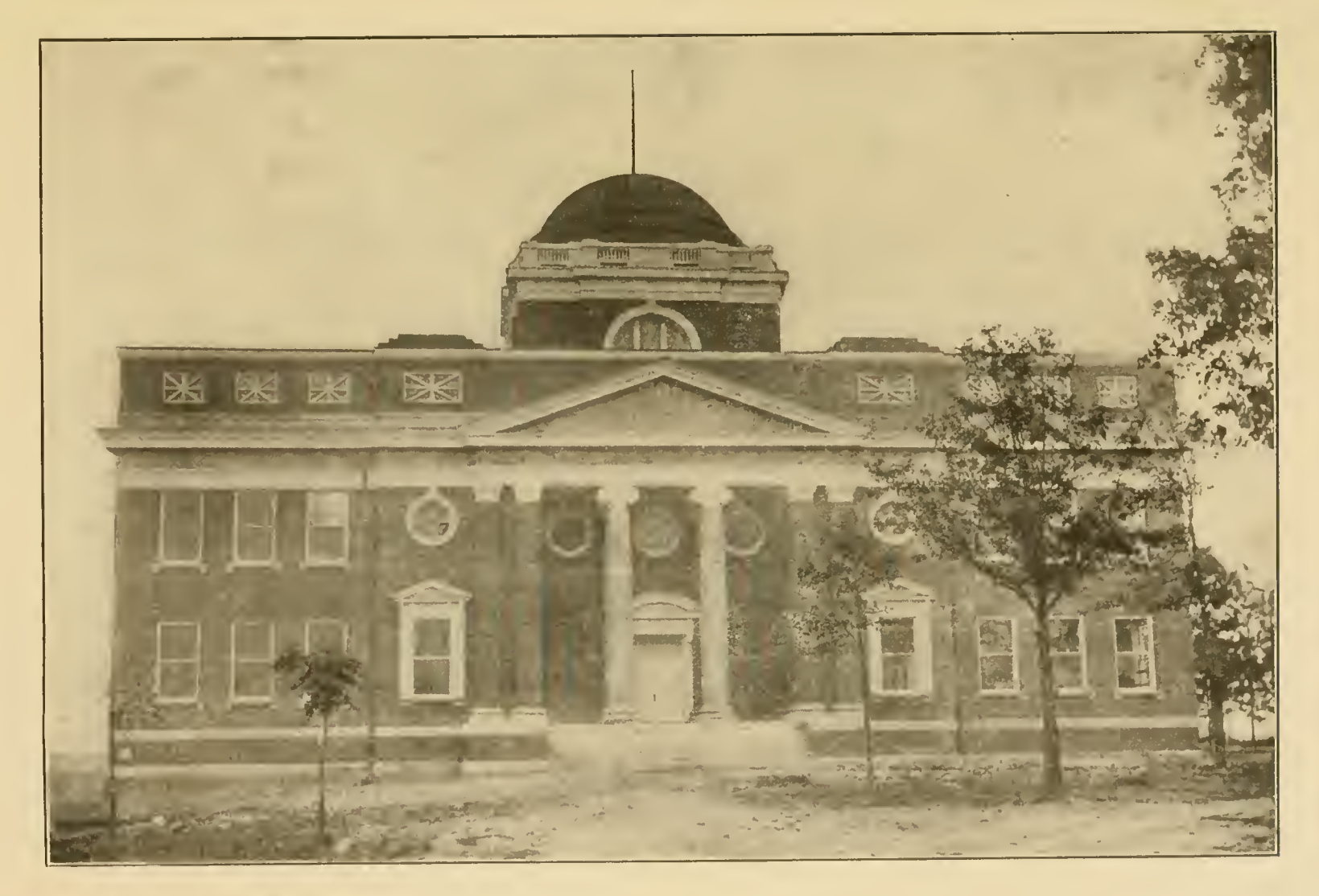
ADMINISTRATION BUILDING, PRESBYTERIAN COLLEGE OF SOUTH CAROLINA