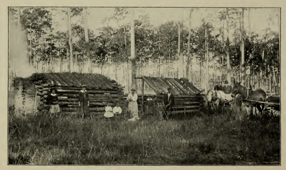
NEGRO CABINS IN THE PINE WOODS OF FLORIDA.