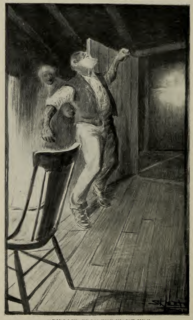
"RIDDLED FROM THE WAIST UP."