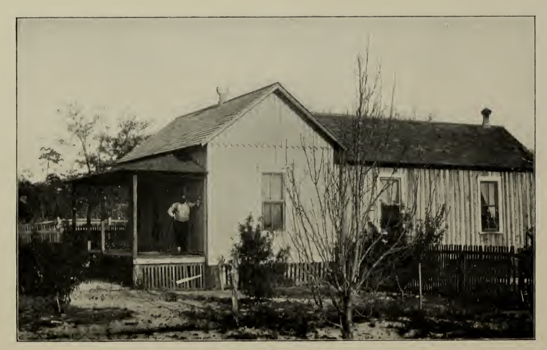
NEGRO CABIN, RED CITY, FLORIDA.