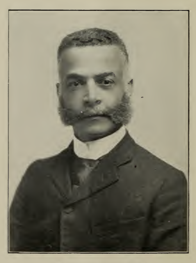
HON, ARCHIBALD H. GRIMKÉ, American ex-Consul to Santo Domingo.