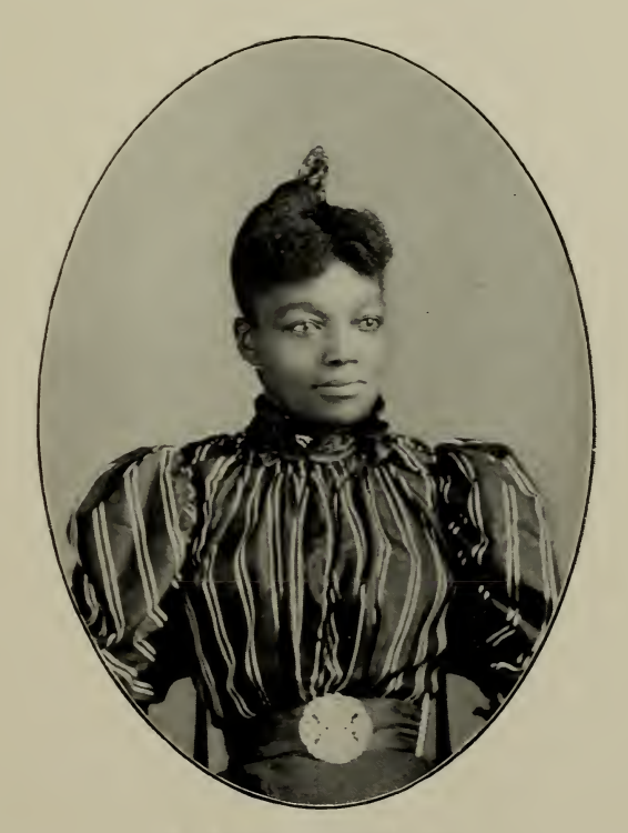
A TYPICAL FLORIDA GIRL.