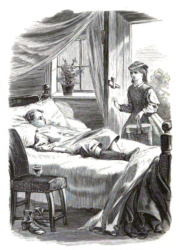
His leg was bound up with wooden splints. FRONTISPIECE. See page 14.