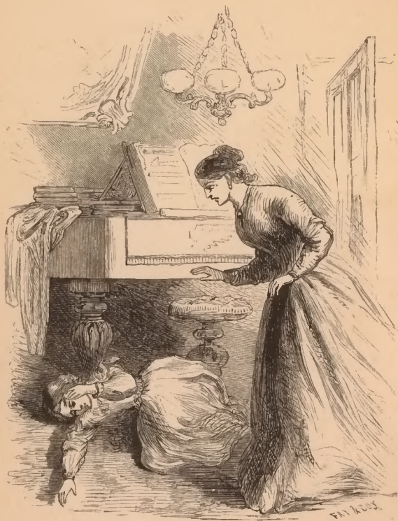
Else's Fall.—See page 245.