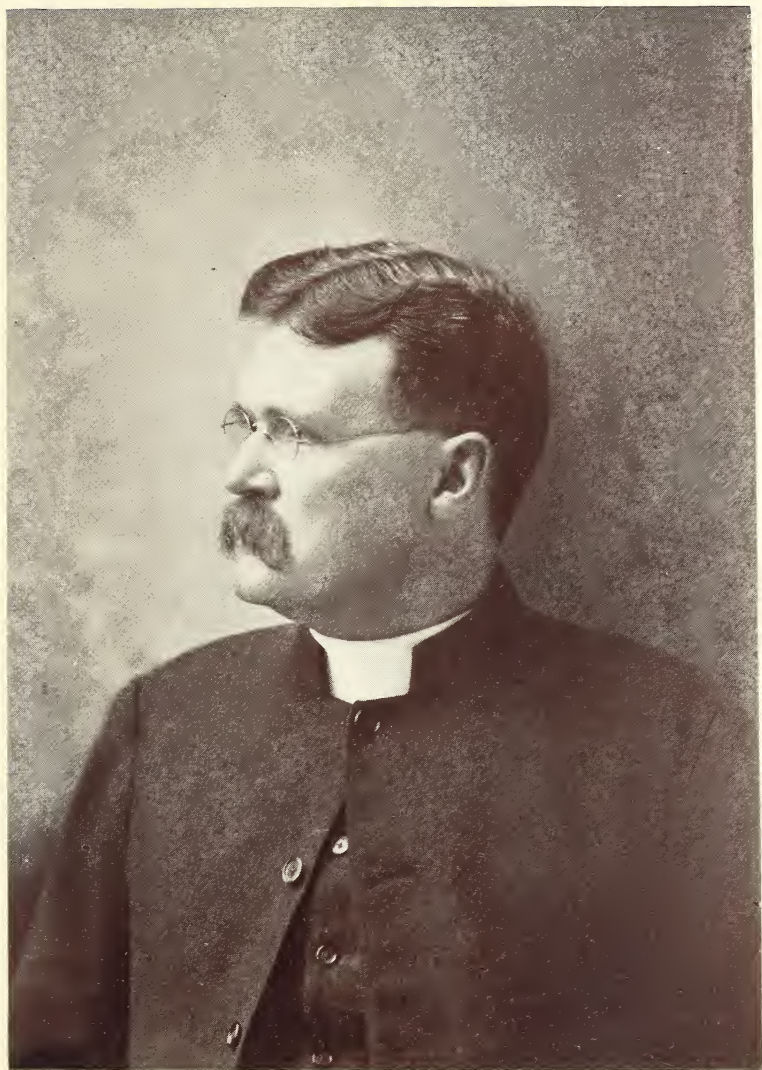
ON SECOND FURLOUGH IN AMERICA, 1897