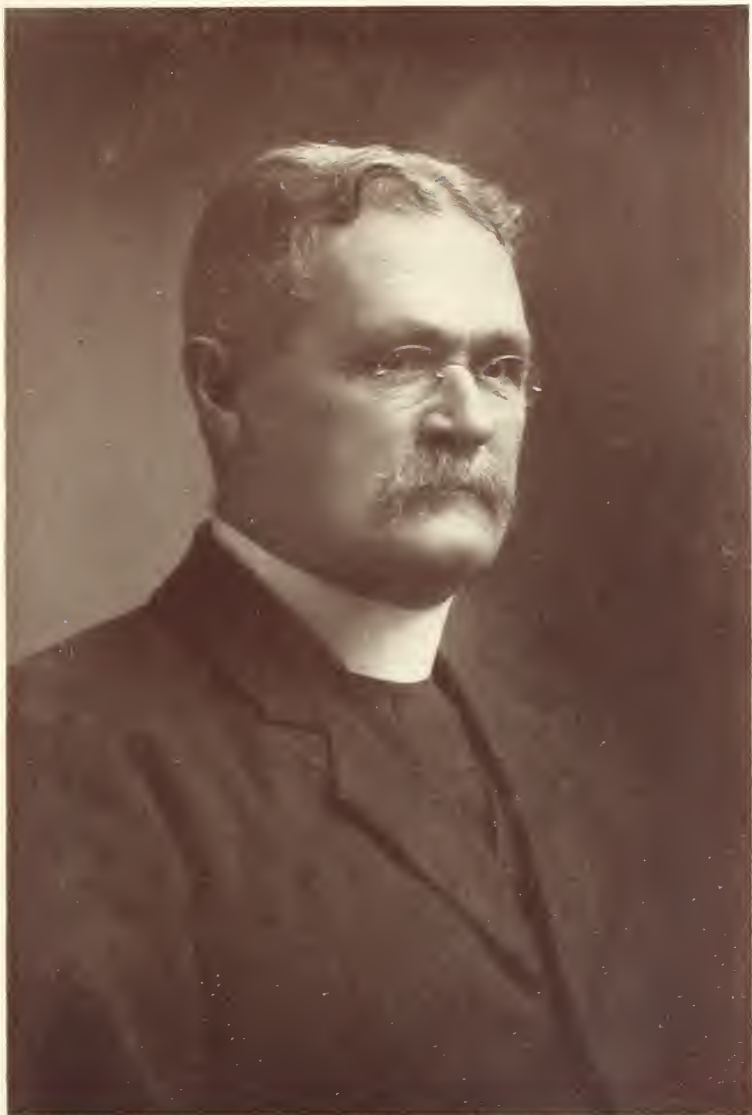
AS VICE-CHANCELLOR OF THE PUNJAB UNIVERSITY, 1912