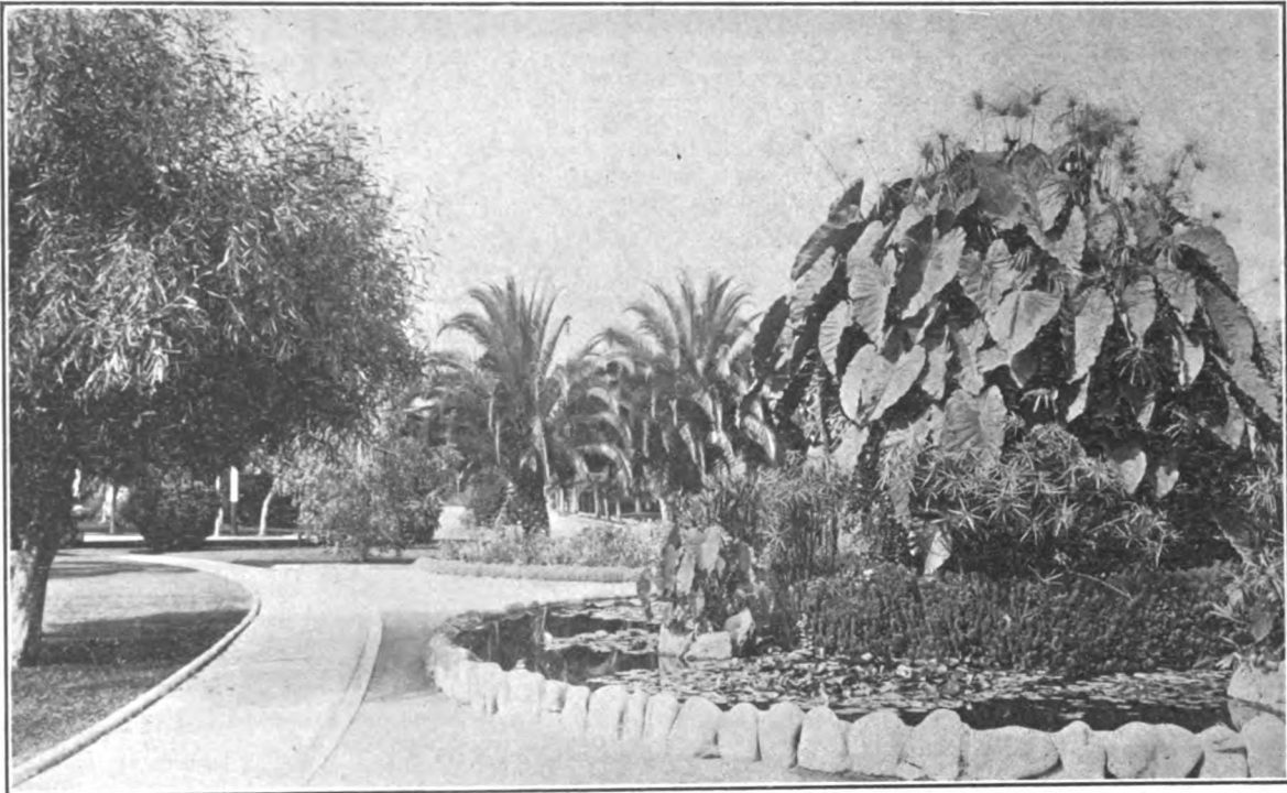
In St. James' Park, Los Angeles.

Pittsburgh, Pa., Thursday, May 14, 1903.