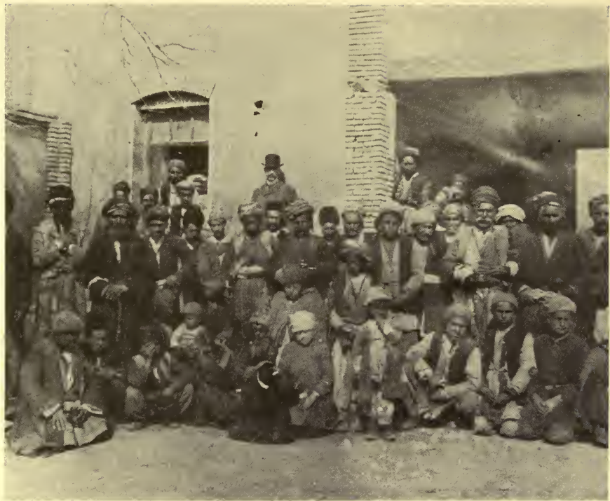
Dispensary Day (outdoors)