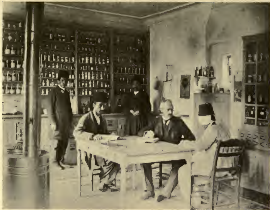
Dispensary Day (indoors)