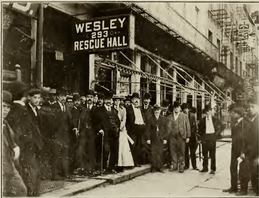
WESLEY, NOW HADLEY HALL.