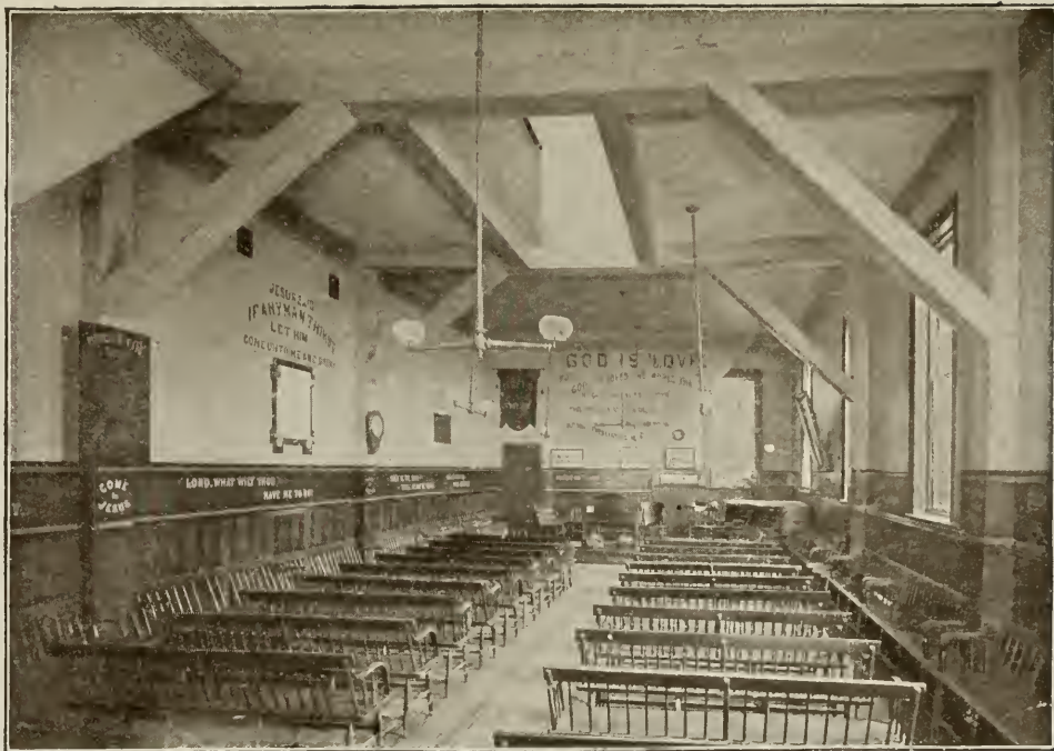
INTERIOR OF WATER STREET MISSION.