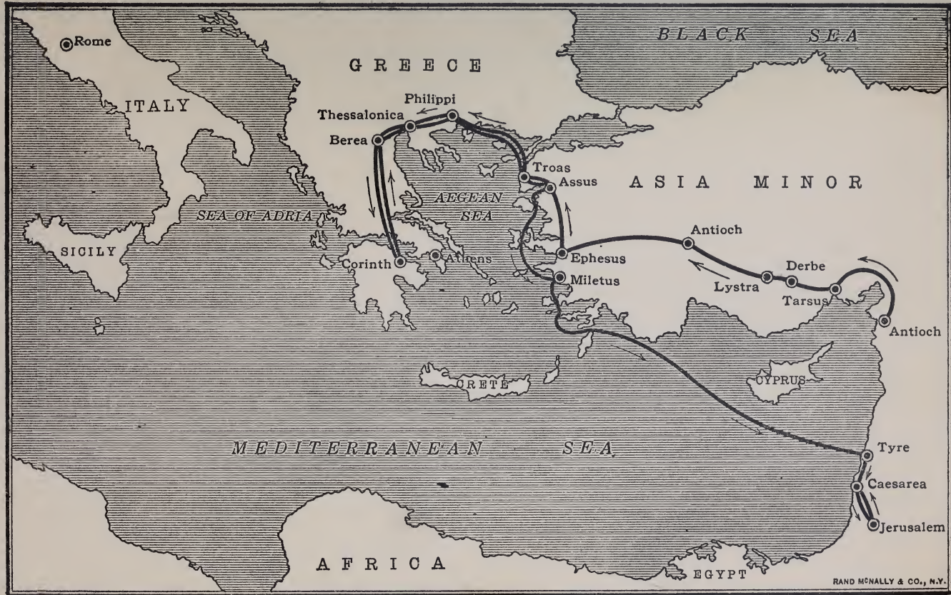
CHART OF THE THIRD JOURNEY