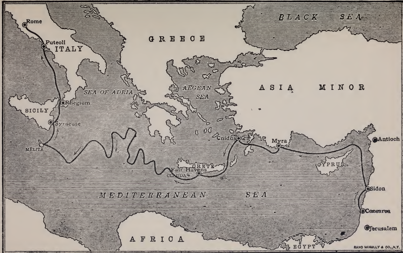
CHART OF PAUL'S LAST VOYAGE