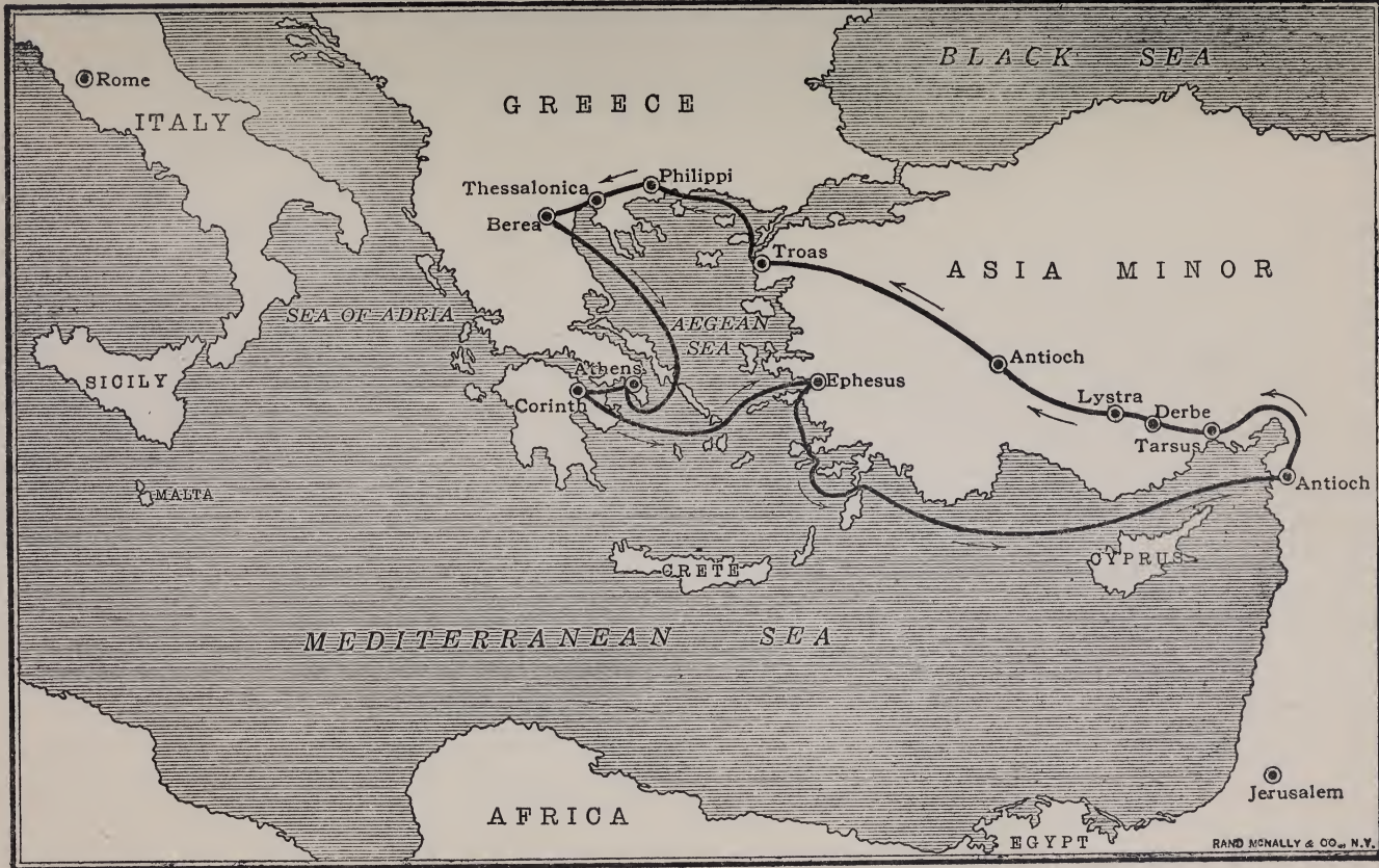
CHART OF THE SECOND JOURNEY