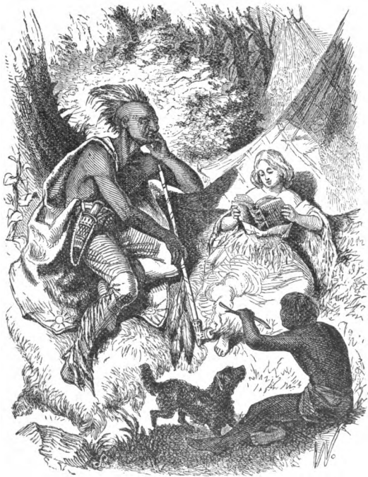
Reading the Bible.