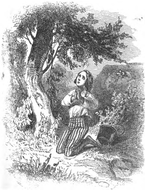
The Prayer for Help.