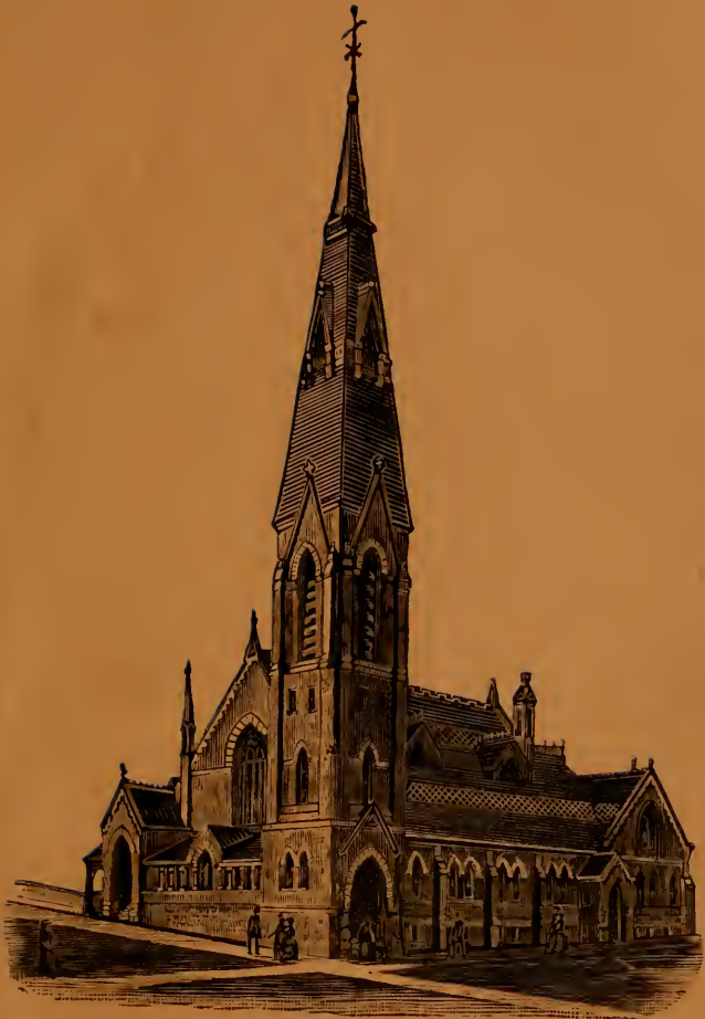
FIRST PRESBYTERIAN CHURCH PORTLAND, OREGON