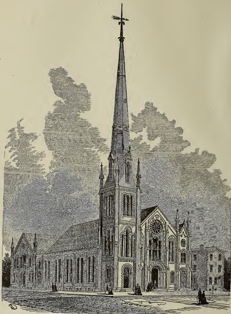
FIRST PRESBYTERIAN CHURCH, CAMDEN, N. J. Corner Stone laid June 22, 1871. Dedicated June 1, 1873.

Allen County Public Library 900 Webster Street PO Box 2270 Fort Wayne, IN 46801-2270