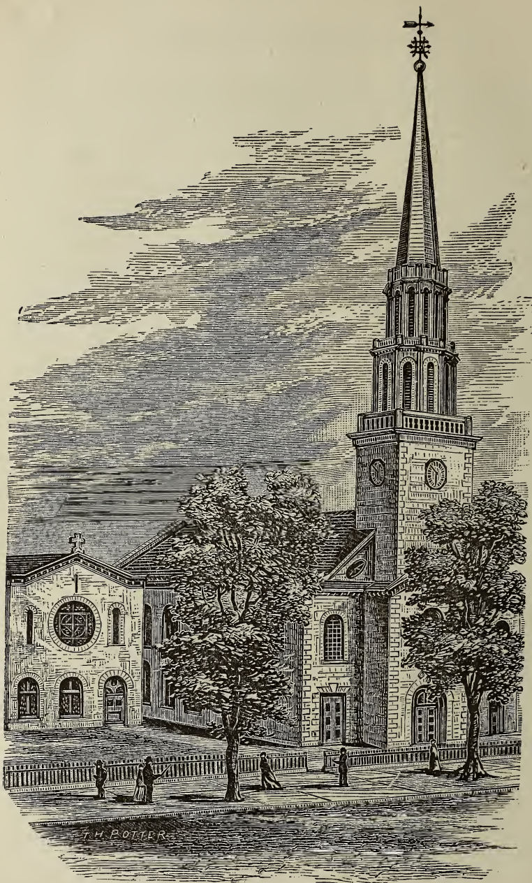
FIRST PRESBYTERIAN CHURCH, NEWARK, N. J. Corner Stone laid September, 1787. Opened for worship January 1, 1791.