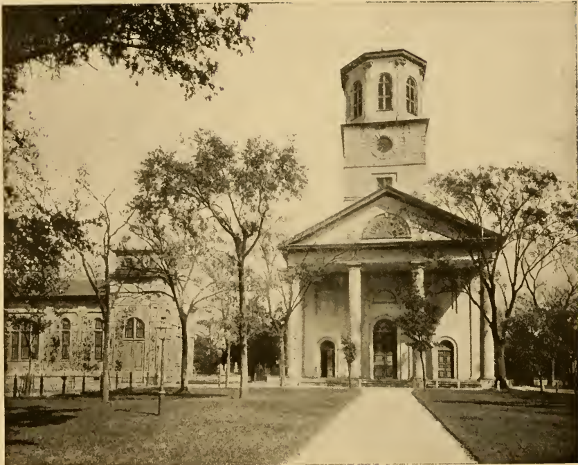
SUNDAY SCHOOL BUILDING.