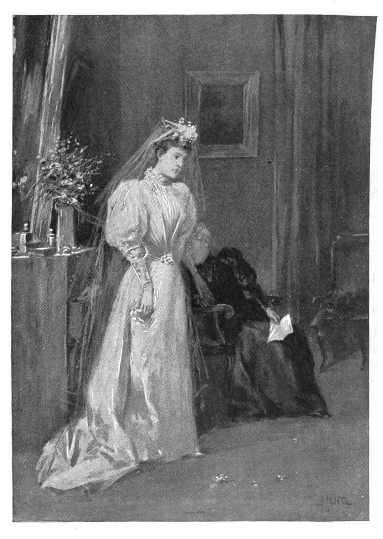
" O, Mary, my poor girl. what shall we do?"