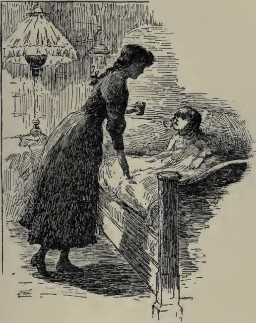
TAKING CARE OF BUBBY.