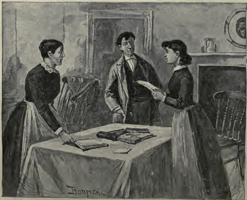
CAROLINE RECEIVES JUDGE DUNMORE'S INVITATION.