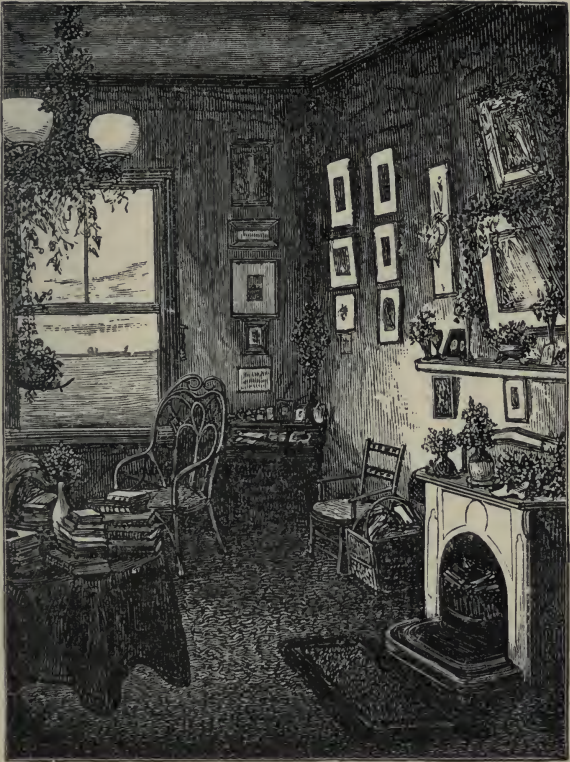
THE DOCTOR'S RECEPTION ROOM.