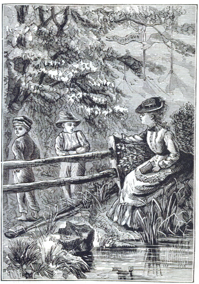
" She must decide at once." Page 278.