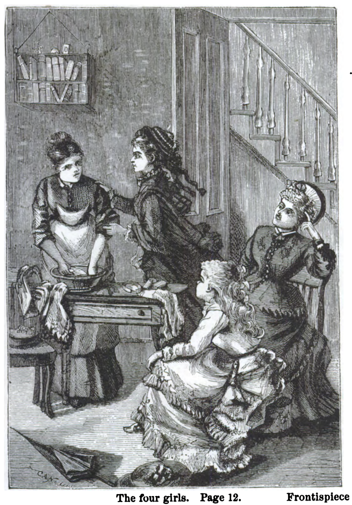
The four girls. Page 12.